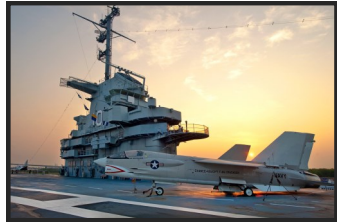
Patriots Point, guided tour!

MAIL TO: APPALACHIAN CONFERENCE, 5847 OAK GROVE AVENUE, DUBLIN, VA 24084