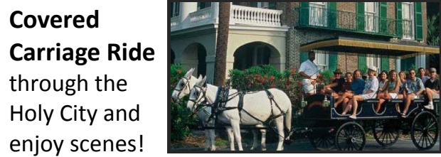
Covered Carriage Ride through the Holy City and enjoy scenes!