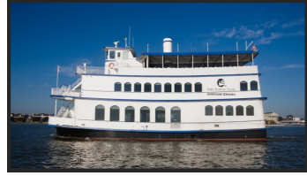
Charleston Dinner Cruise, enjoy a fine meal as you cruise the Harbor!